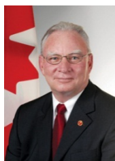
The Honourable Larry W. Campbell

Liberal Senator from British Columbia, former Chief Coroner for British Columbia and former mayor of Vancouver